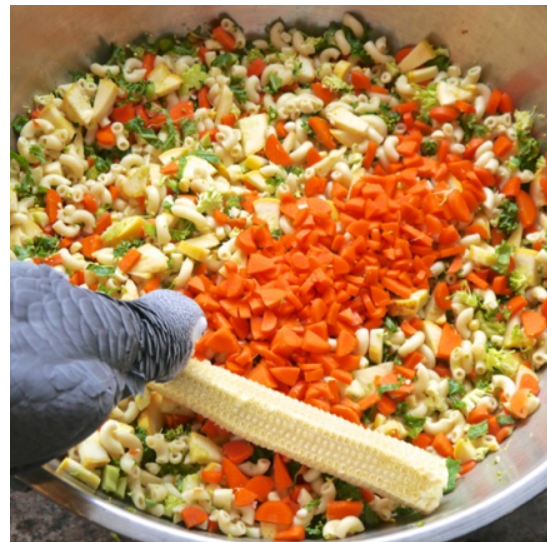
Sanctuary residents benefit from customized diets based in fresh produce, whole, healthy human-grade nuts and nutritionally complete pellets.