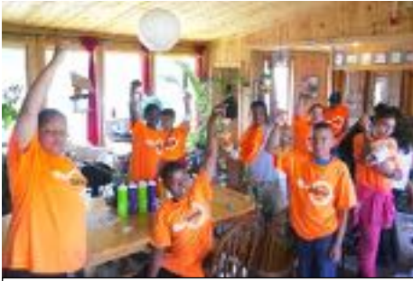
Children from the Providence After School Alliance's "After-Zone" summer program