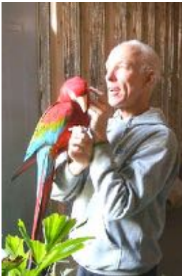
Brian Jones Photography & Graphic Design (Volunteer)