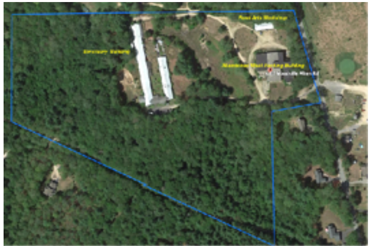
Our 23 actor property is under development as a regional center for humane education and a nature retreat.