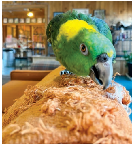
Birdy, tearin' it up!

Many sanctuary residents at the NEWS prefer avian companionship to that of humans and do well in aviaries that support flock-life while providing a desirable degree of separation