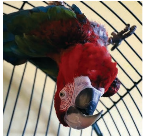
Left to right: Romeo and Juliet, blue and gold macaws; Congo, green-winged macaw.

In early October of 2021, we received a surrender request from a family in Vermont that had three macaws in a dire situation; their mother had passed and the birds were left alone in the home. The relinquishment form stated “Needs real medical attention 2 birds are very plucked. No tails. The home is filled with mouse poop and urine.” The woman lived alone and after her passing there was no one left to care for the birds. The birds are two seven-year-old blue and gold macaws named Romeo and Juliet and a ten-year-old green-winged macaw named Congo . We quickly responded, offering assistance and placement for the birds, and within two days, the family delivered them to Foster Parrots.